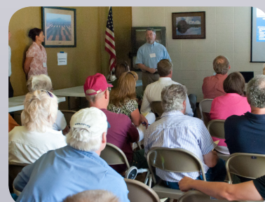
Public outreach meeting, Shelby, MT 2012