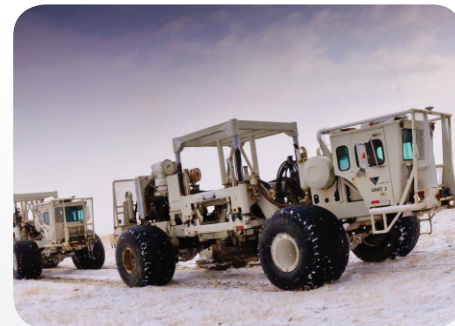
Seismic “Thumper” trucks

Email: bigskycarbon@montana.edu Phone: 406-424-8024